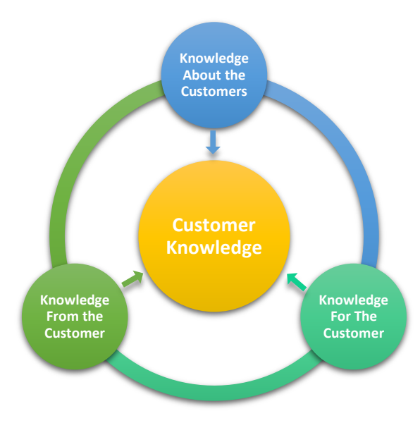
Figure 2: Knowledge Flows

processes, but also tacit knowledge such as customer knowledge or knowledge from channels and stakeholders (Davenport et al., 1998; Wilhelm et al., 2013). Gibbert, Leibold, & Probst, (2002) states that most companies that define themselves as market-oriented or customer-oriented do not actually benefit from customer knowledge which is their most valuable resource, and suggests the concept of Customer Knowledge Management (CKM), which ensures the knowledge residing in the customer is gained, shared, and expanded in a way that will benefit both customer and the corporate. Customer knowledge, which focuses on customer ideas and opinions rather than transactional data, creates synergy with customers, gets better and more timely results in product innovation, and gives companies a significant competitive advantage in ensuring customer satisfaction and loyalty (Srikantaiah et al., 2000). CKM includes three different types of knowledge (for, from and about the customer), which are theoretically defined as customer knowledge flows and differing from Customer Relationship Management (CRM) by focusing on knowledge from the customer rather than knowledge about the customer (Gebert et al., 2003; Gibbert et al., 2002; Salomann et al., 2005; Wilhelm et al., 2013).