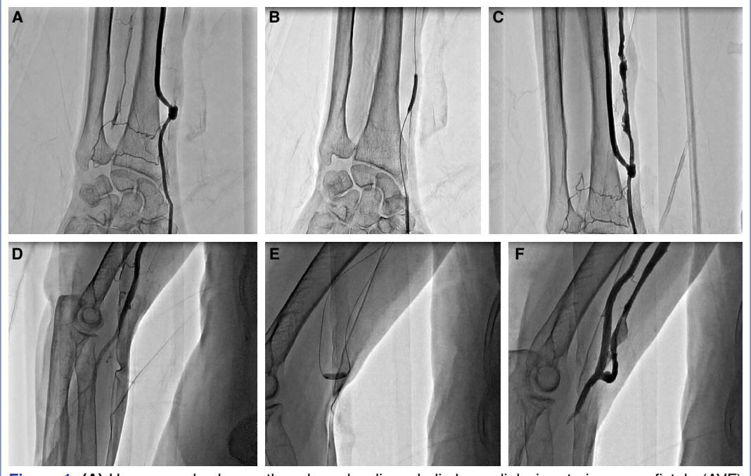
Figure 1. (A) Upper panels show a thrombosed radiocephalic hemodialysis arteriovenous fistula (AVF) and (B, C) successful treatment with balloon angioplasty. (D-F) Lower panels demonstrate successful treatment of thrombosed brachiocephalic hemodialysis AVF.

In all cases, arterial access was used as the entry site for the interventional procedure. Brachial artery access was used in 18 patients, femoral artery access in 10, distal radial artery access in 1, and multisite access (femoral, radial or brachial) was used in the remaining 4 patients. The selected artery was punctured with an angiographic needle using local anesthesia (2% prilocaine). After inserting a guidewire into the artery, the needle was removed and a 5-F or 6-F sheath (Terumo Corp., Tokyo, Japan) was inserted using the Seldinger technique. An antegrade approach was used for brachial artery access. Diagnostic angiography was performed to image the arterial side and