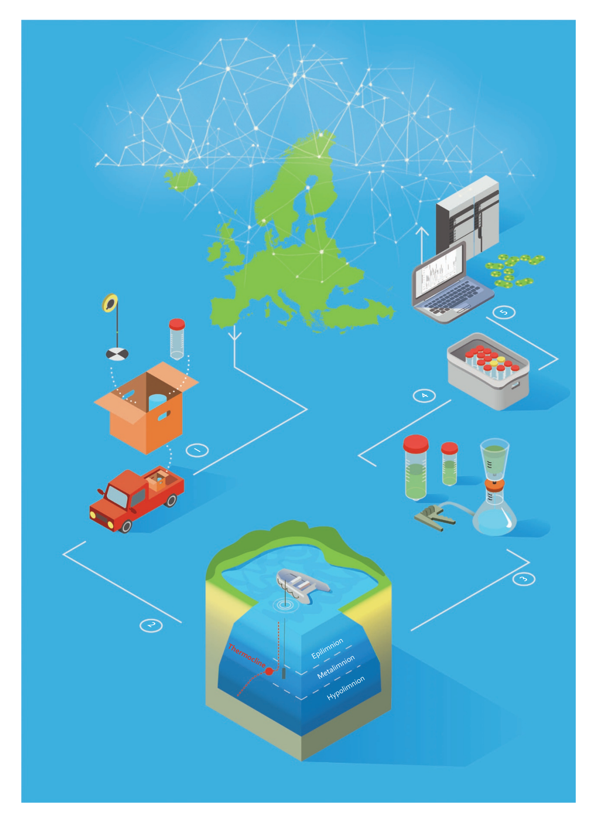
Figure 2. Schematic overview of the European Multi Lake Survey (EMLS). CyanoCOST and NETLAKE members performed the sampling routine by: 1. Preparing the sampling material to meet the standardized procedures 2. Accessing the lake site and acquiring integrated water samples from the bottom of the thermocline up to the water surface 3. Processing and preserving the water samples based on requirements for subsequent analysis 4. Shipping samples to a central receiving laboratory 5. Analysing nutrient, pigment and toxin concentrations in dedicated laboratories. After quality control checks and data integration the dataset returns to the European network and becomes publically available for further research. Created by Sarah O'Leary and Eilish Beirne.