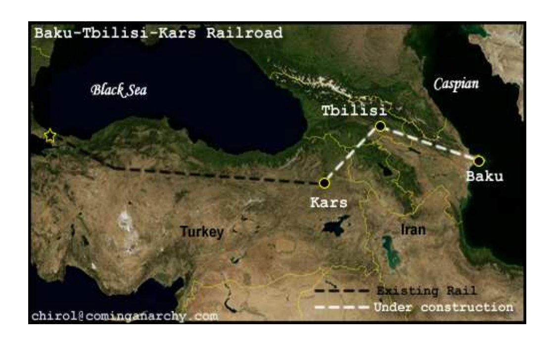
Map 4. Baku-Tbilisi-Kars Railway Project

Reference: http://cominganarchy.com/wordpress/wp-content/uploads/2007/12/ktb_rail.jpg