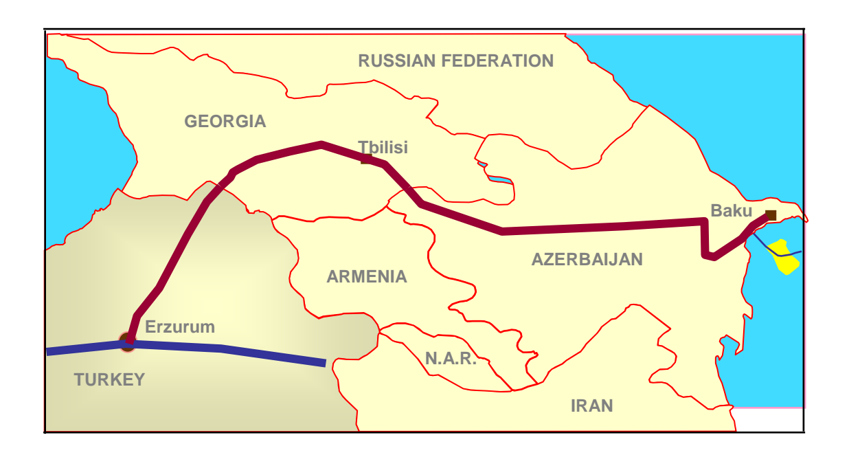
Map 5. Baku-Tbilisi-Erzurum Project (Shahdeniz)

Reference: http://cominganarchy.com/wordpress/wp-content/uploads/2007/12/ktb_rail.jpg