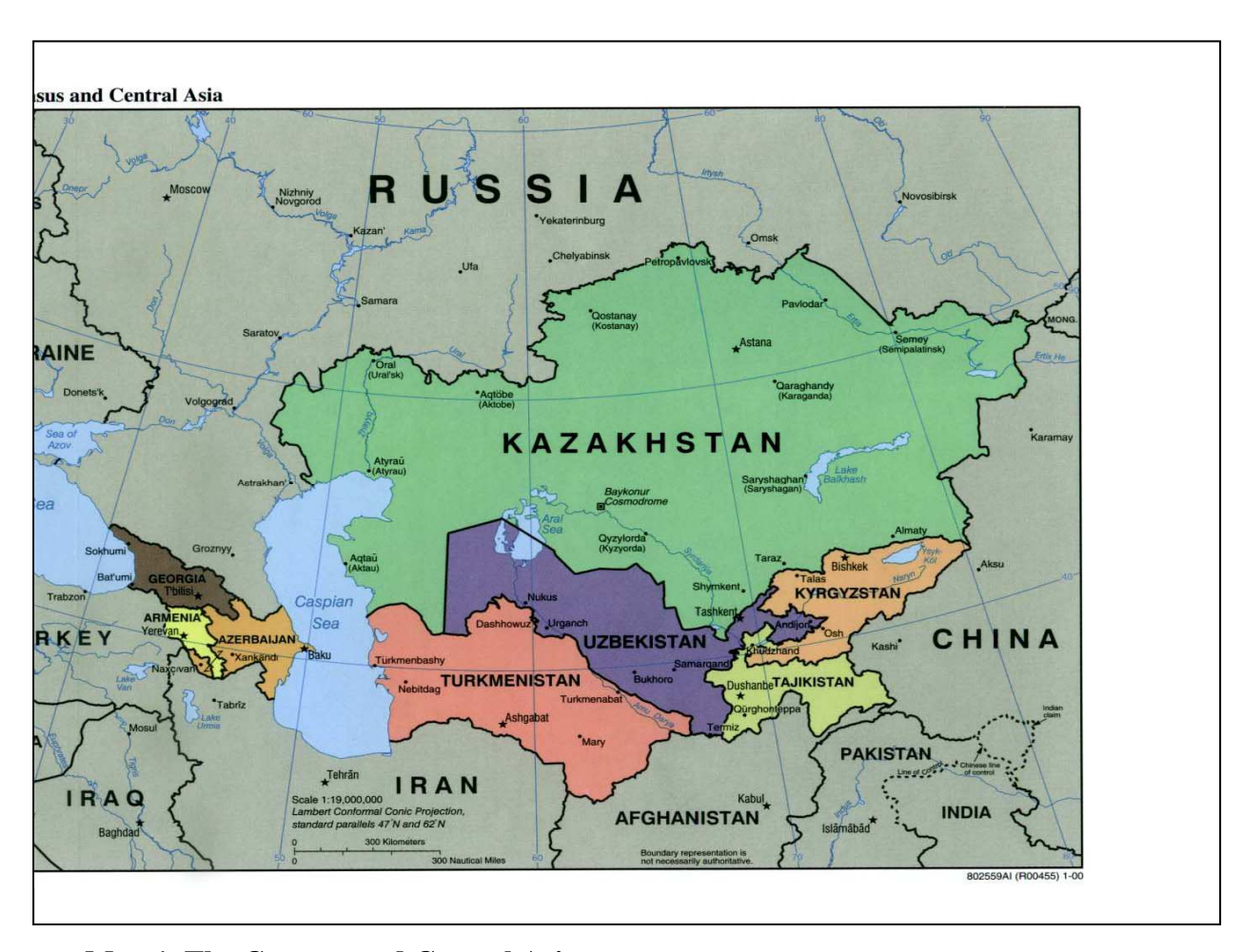
Map 1. The Cacasus and Central Asia