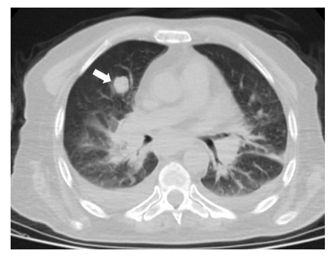
Figure 2. Axial non-contrast computed tomography image shows a nodule in the right lower lobe (arrow).