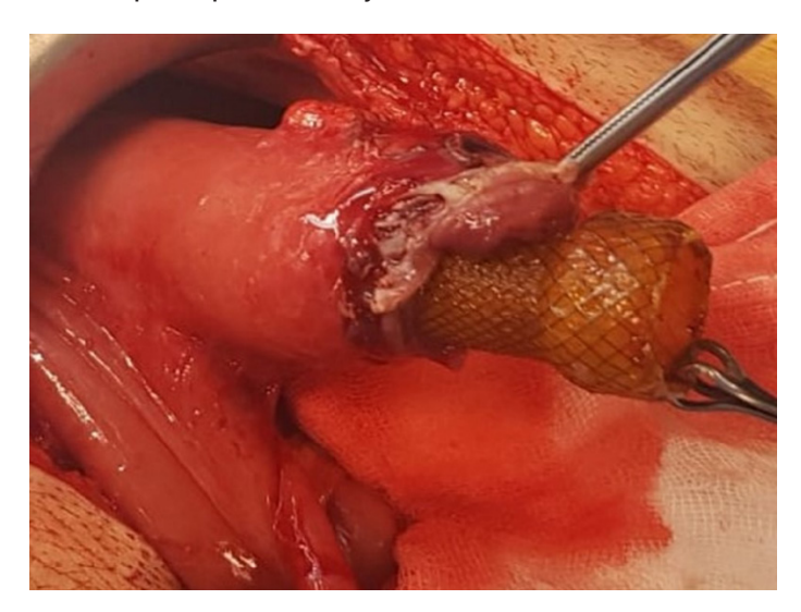
Figure 4. Extraction of the stent from the stump of Y Limp

attempts for removing of the stent. During surgery, the tip of the stent was attached at the stump of the Y limp (Figure 3). The stump of the Y limp was opened and the stent was extracted (Figure 4). The stump was reclosed using linear stapler (Figure 5). Patient's postoperative course was uneventful. Oral consumption was started on the 3th postoperative day and he was discharged at the 6th postoperative day.