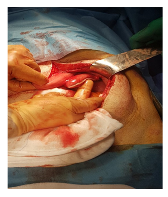
Figure 5. Closure of the stump with linear stapler.