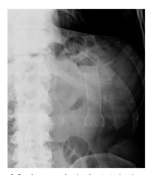
Figure 2. Esophagogram showing the stent migration

jejunostomy anastomosis on the fifth postoperative day (Figure 1). An expandable stent was inserted endoscopically. The stent was left in place for more than 2 months until the defect was closed. When it was decided to remove the stent via endoscopic route, we detected that the stent was not where it should be. An upper esophagogram showed that the stent moved to the anastomotic line of the Y limp and was found to be attached to the stump of the Y limp which did not allow the stent to past more distally (Figure 2).