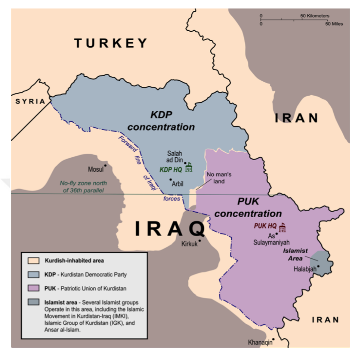
Map 1: The administrative division between the KDP and the PUK in KRG<sup>185</sup>