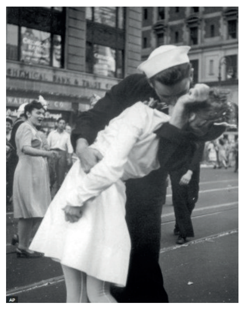
Figure 1. The Photograph that Symbolizes the End of World War II

Nevertheless, there may be several exceptions in terms of the transitivity between circles. A sailor in the crowds gathered at Times Square in New York to celebrate the end of World War II (1939-1945) kissed a nurse who was a total stranger on her lips with the excitement of the moment. Photographers immortalized that moment. The kiss of sailor George Mendonsa and nurse Greta Zimmer Friedman became a symbol of the end of World War II.